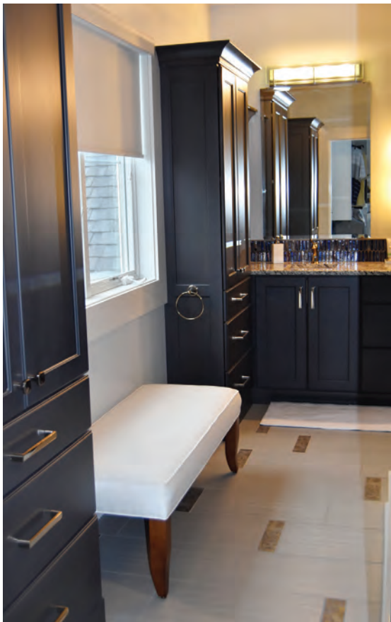
The master suite is a retreat all its own with seating area, gorgeous views of the lake, huge walk-in, floor-to-high-ceiling shower, vanity areas, and walk-in closet.